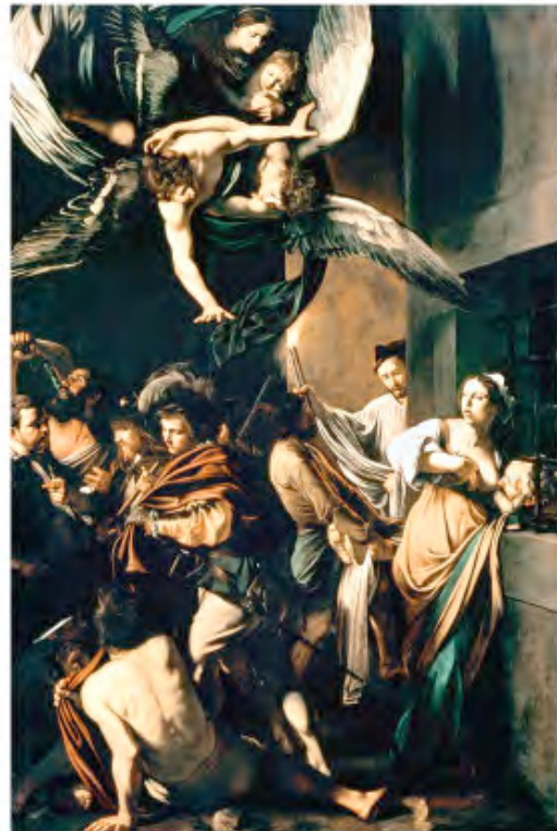
The Seven Acts of Mercy

beautiful tradition of the seven acts of mercy – corporal and then spiritual.