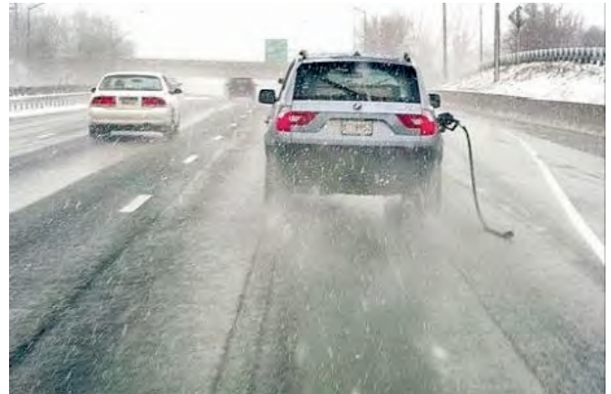
This is what impatience looks like