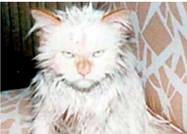
This is what a bad mood looks like

If you can start the day without caffeine, If you can always be cheerful, ignoring aches and pains, If you can resist complaining and boring people with your troubles, If you can eat the same food every day and be grateful for it, If you can understand when your loved ones are too busy to give you any time, If you can take criticism and blame without resentment, If you can conqueror tension without medical help, If you can relax without alcohol, If you can sleep without the aid of drugs, Then you are probably... The Family Dog!