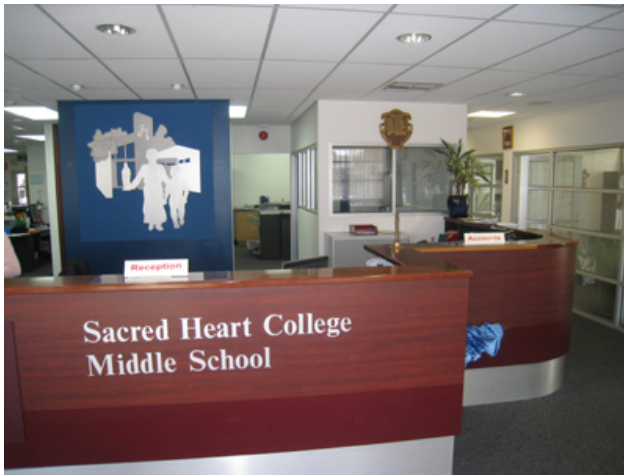
SHCMS Front Office