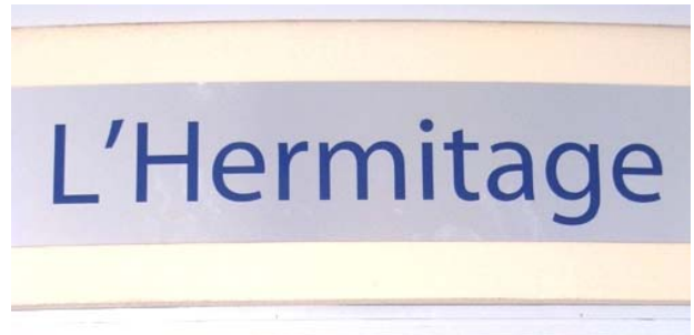
SHCMS L'Hermitage Resource Centre