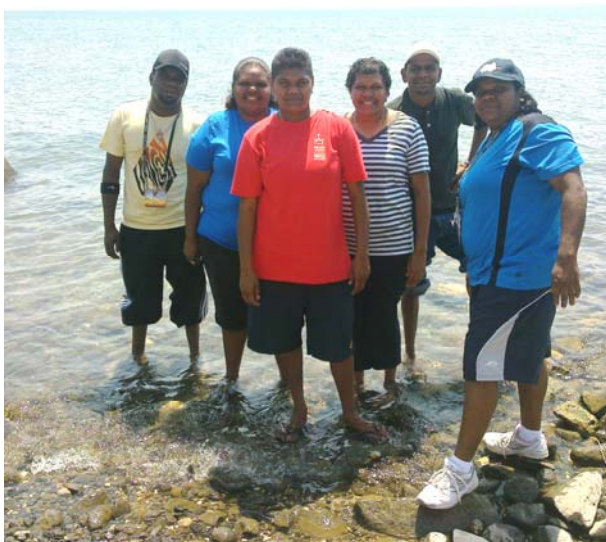
At the Sea of Galilee.