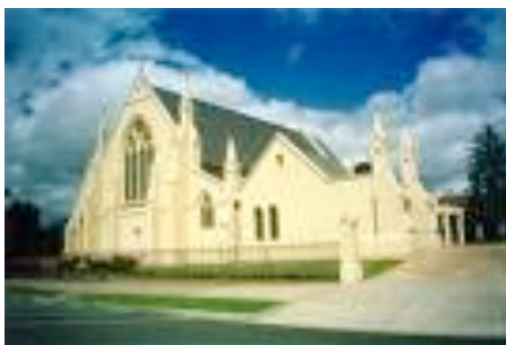
St Mary's Cathedral, Sale

The rapid expansion of Melbourne's outer eastern suburbs into the diocese meant that most of the population was now concentrated at the western end, with 92.7 percent of the diocese's Catholic population living in or to the west of Sale parish.