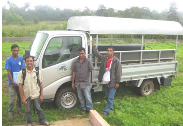
The new truck for patient transfer. One third of the cost was provided by Shepparton donors to SETAG

East Timor is the poorest country in Asia and I was amazed as a university student at the commitment and generosity of the people of Shepparton through SETAG . They have changed the quality of care available to over 140 people by providing roofing for a new centre and a co-sponsorship of a low-tray truck called locally an “Angunna”.