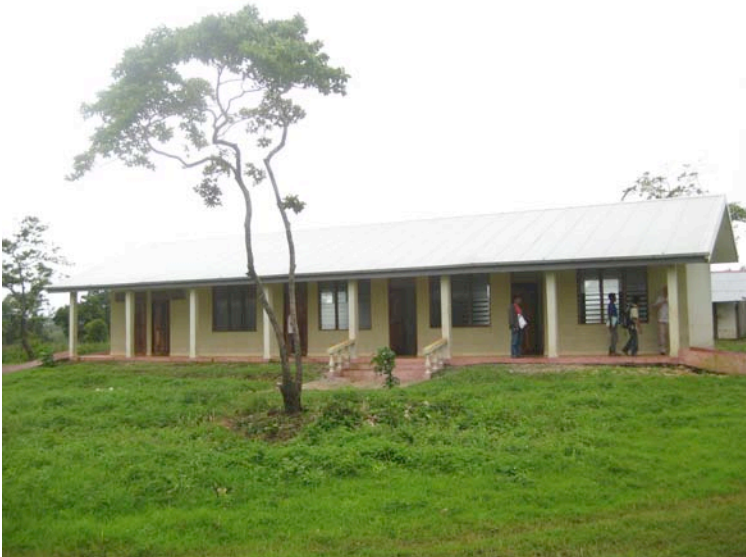
Durasula, the new centre for Katilosa. The roofing was provided by Shepparton donors to SETAG in 2009.