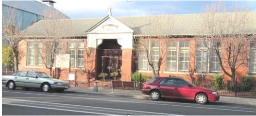
The Montagne Centre

220 Best Street Sea Lake VIC 3533 Ph: 03 5070 2018