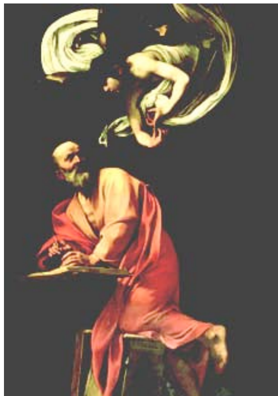
A detail of Caravaggio’s St Matthew and the Angel.

This article comes from THE TABLET 11 April, 2009