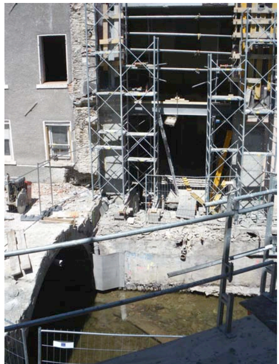
Remodelling work continues at the Hermitage, June 2009