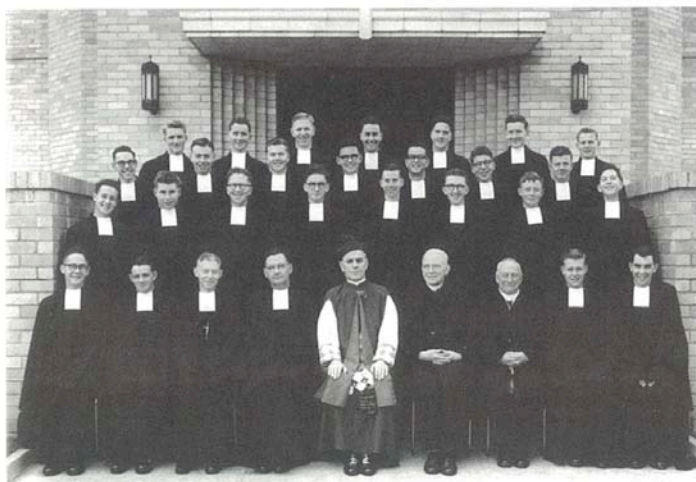
Reception and First Vows Our Lady of Good Counsel Church, Deepene 2nd July 1959

Today we are witnessing a cultural change of epic proportions, comparable to that which occurred around the time of the birth of the Institute. Nothing is immune to this change, and because of it, many things will die, others will be born, and some will survive, though transformed.